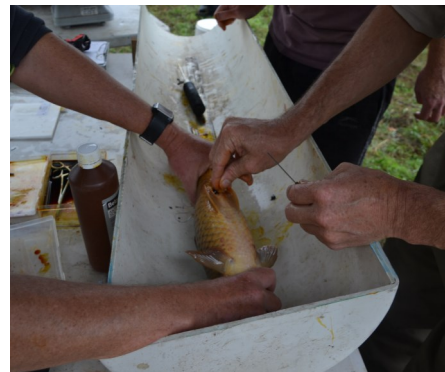
Carp being tagged with an electronic tag by NSW Fisheries staff. The tagged fish will provide important movement data which is currently unknown for the upper Murrumbidgee River.

On all levels, we pass on a BIG thankyou to everyone that supported the UMDR in 2015. We look forward to working with you in 2016.