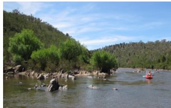
Right: in high quality areas of the 'bidgee, the control of willows is the only intervention required to protect fish habitat and riparian health.