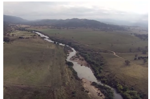
The Bumbalong Valley has been historically cleared, disconnecting the high quality habitats of the Bredbo and Colinton Gorges. This project will address connectivity and instream fish passage.

Cooma Waterwatch has established three macro invertebrate (waterbug) survey sites on the Murrumbidgee River at Bumbalong. These sites will monitor river health response resulting from the RoCUB's riparian rehabilitation and re-vegetation works. This is an example of how Waterwatch data is being used to track river health and how catchment organisations can benefit from use of such data for their own projects.