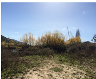
Left: heavy infestations of willows will be a controlled and replanted by RoCUB.

During 2015, progress on the RoCUB project included the control of willows of the top 4km of the project area, the completion of the erosion and sediment assessment by Brad Davies (NSW Soils Conservation Service), holding our first planting days and preparation for large scale plantings in autumn (including a community planting day hosted by Greening Australia). First up on the cards for early 2016 includes blackberry control and removal of willows in priority areas.