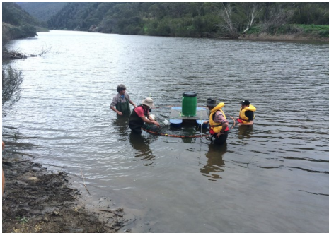
Volunteers setting the carp net at Scottsdale Reserve.

An assessment of the Casuarina Sands Fishway by Dr Martin Melan-Cooper and ACT Government's Conservation, Planning and Research staff in March 2015 showed how the slots of the fishway need to be amended to enable fish passage during low flows. This is good news for our native species. The assessment was funded by the Murray Darling Basin Authority, under the UMDR. The ACT Government will fabricate and install the new steel slots to make the fishway operational once again.